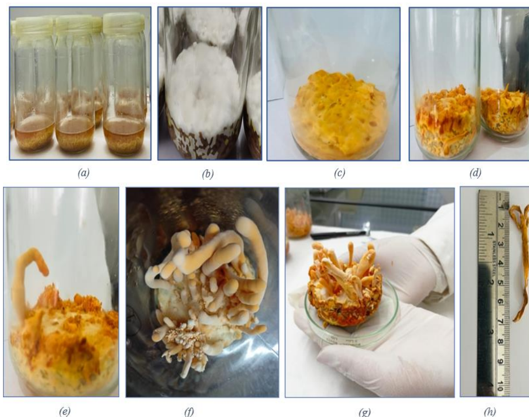
Fig. 1(a-h). Inoculation of liquid spawn into bottles